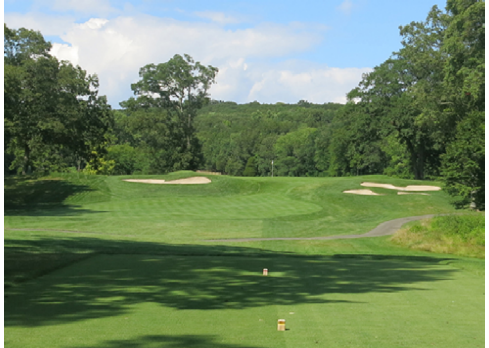
The difference in a golfer's perceived difficulty of a golf hole with and without a backdrop of trees is remarkable. Once a backdrop is removed, a green looks smaller, the topography comes alive and the hole looks much more challenging.

Several famous golf course architects commented or wrote about trees. The following A. W. Tillinghast quote, from the book titled The Course Beautiful , encapsulates his opinion of trees used as backdrops behind greens: "... in the case of a green played directly beyond the slope of a hillock and sharply defined against the sky. Barren of any nearby object, such as a tree for instance, the distance of