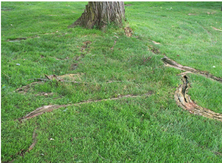
Some tree species have extremely aggressive root systems. Above-ground surface roots are a menace to maintenance equipment, golf carts, and golfers.

There are both appropriate and inappropriate tree species for use on golf courses and in fine turf areas, so