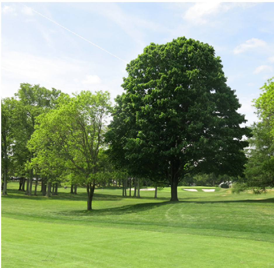
Competition between trees is an often overlooked fact of nature. The terrific quality sugar maple on the right will be ruined if the more recently planted locust on the left is not removed. The choice is simply a matter of quality vs. quantity. Unfortunately, all too often quantity wins.

choose tree species wisely when developing a tree-management program for a specific location. There always are exceptions, but usually it is wise to rely on tree species that are indigenous to your geographic area because they are more likely to perform well. Observing which tree species are performing well on your course or in the surrounding area also can provide valuable clues as to what trees might be successfully used at your facility. It is extremely important to consider longevity, diversity, and susceptibility to disease and insect pests when selecting tree species. Major pest or disease outbreaks can occur with little warning, severely affecting susceptible tree species. Dutch elm disease decimated American elm tree populations years ago, and golf courses and communities that had large populations of American elms were devastated. Similar effects