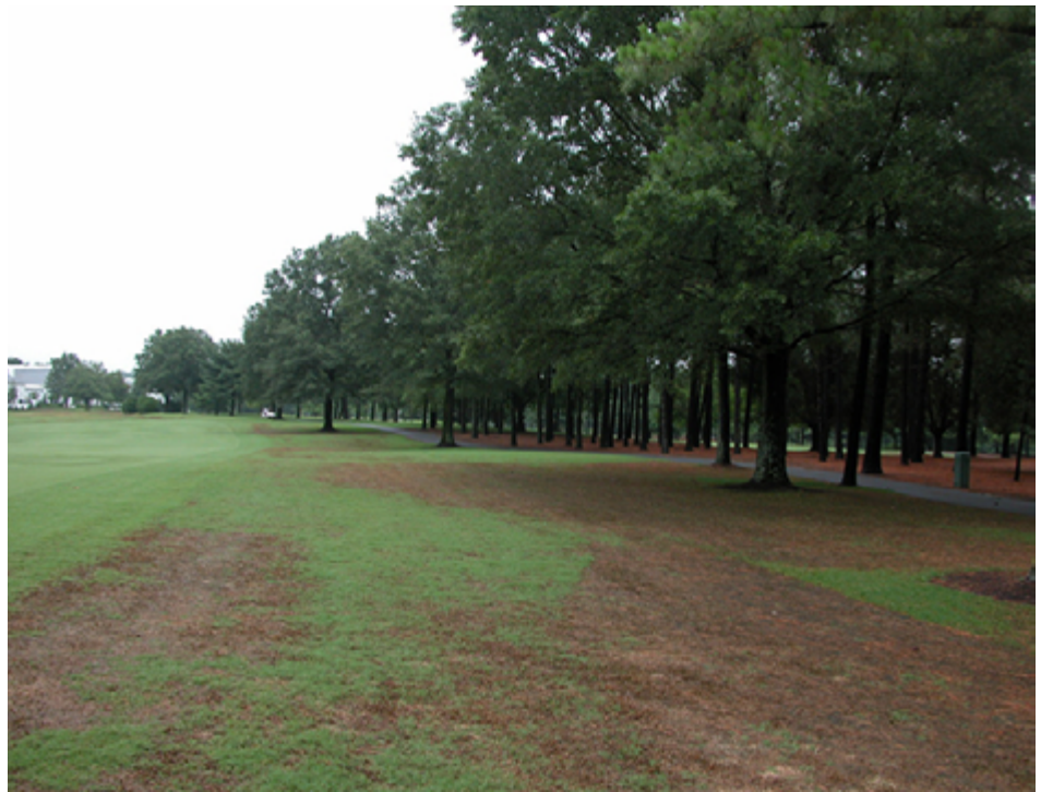
Bermudagrass performs poorly in shade and is much more susceptible to wear injury and winter damage in the absence of sufficient sunlight.

USGA agronomists began helping courses develop tree-management programs in the late 1980s, and many articles were written and presentations were made on the subject. The path to helping courses identify and solve tree problems was paved by education. Courses began to address tree problems, but only grudgingly at first. Many golfers feared that removing trees would make their courses "too easy" and look barren. Many golf courses