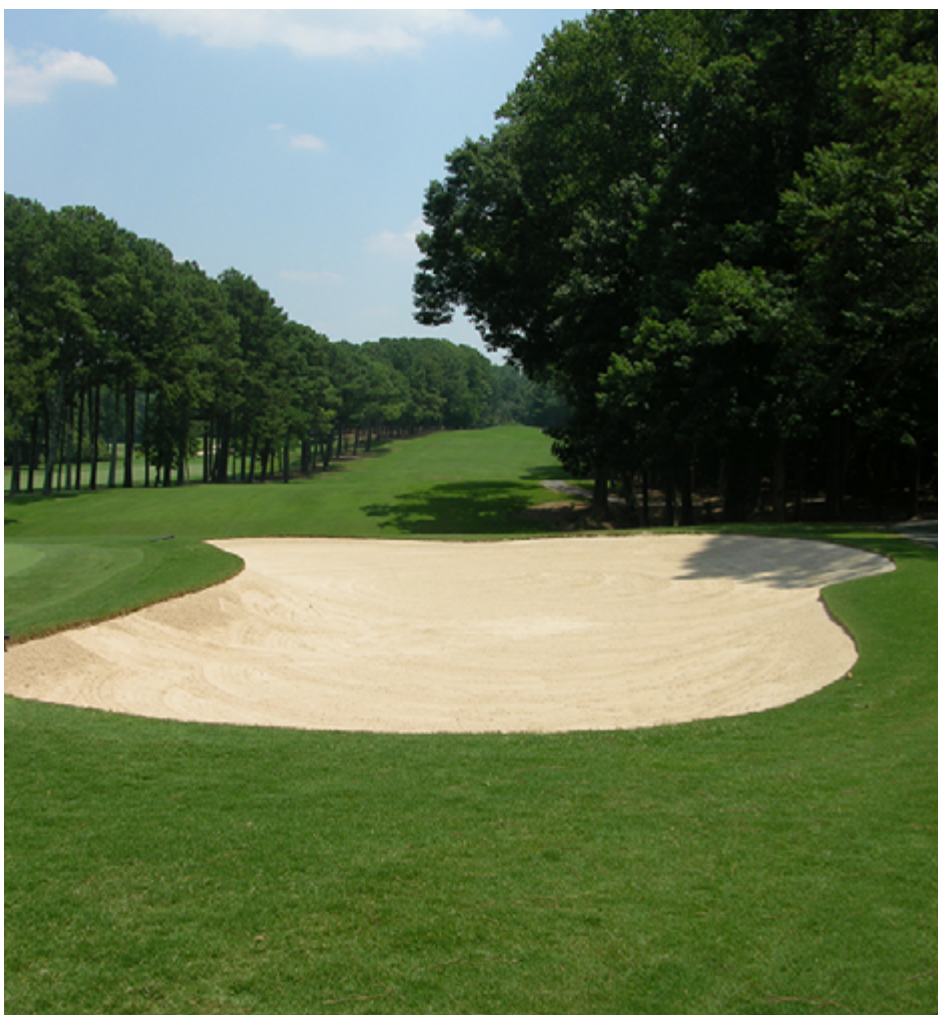
Trees that block advancement from a bunker doubly penalize a miss-hit shot and are termed “double hazards.” For most, golf is a difficult enough game and to penalize a wayward shot so severely just adds insult to injury.