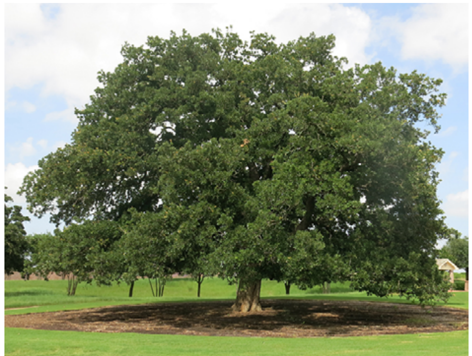
There are few things more majestic than a properly located, stand-alone specimen tree. It is remarkable what a small tree can become with care and foresight.

Poorly located trees forced golf holes out of alignment by narrowing playing corridors and reducing lines of play. Golf holes that were originally intended to provide golfers with multiple lines of play became so choked with trees that often only one option