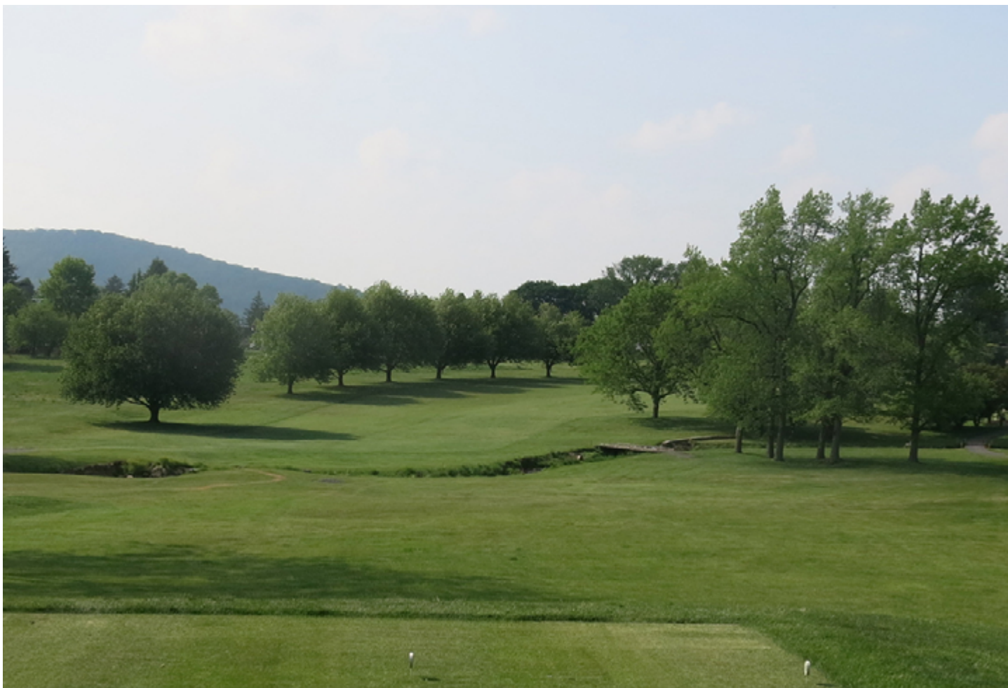
The unnatural tree line on the left side of this hole was added years after the course was built. It effectively shifted the center of the fairway to the right by 10-15 yards, it looks odd, and it penalizes a well-struck drive. More important, it influences play to the right towards an adjacent tee. If trees are to be used on the left side of this golf hole, they should be well left of their current location.

the shot to the green is much more difficult to judge with accuracy than it would were there a tree or two standing forth. All players of ability will bear witness to the baffling length to a naked green, but few actually realize how much more readily the estimate of the eye would be flashed to the brain if sight should fall simultaneously on a lone tree and its neighboring green." Isn't it ironic that golfers still claim to need a backdrop when yardage aids now are so common?